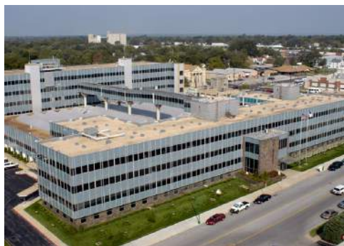
Assembly of God Headquarters Springfield, Missouri 2016 NF Deaf Convention

We look forward to the 2016 NF Deaf Convention that will be held in Springfield, Missouri! Start making your plans and saving your money! We want to encourage you today to --