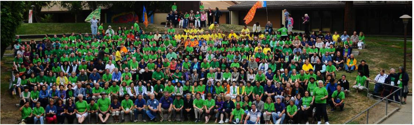
2014 World Deaf Assemblies of God - Group Picture